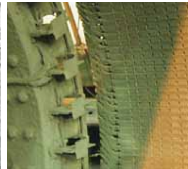
9000 HP Ball Mill Motor