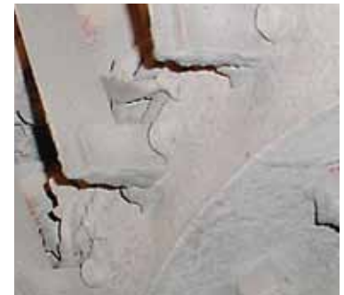
Vacuum Pump Motor