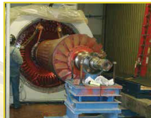
On-Site Turnkey, Disassembly, Repair / Coil Replacement, Assembly and Start Up of a 33,250 kVA 12.7 kV Generator