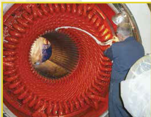
On-Site Recondition of (6) 3,000 HP 4 kV Ball Mill Motors with Before and After Dry Ice Cleaning Results