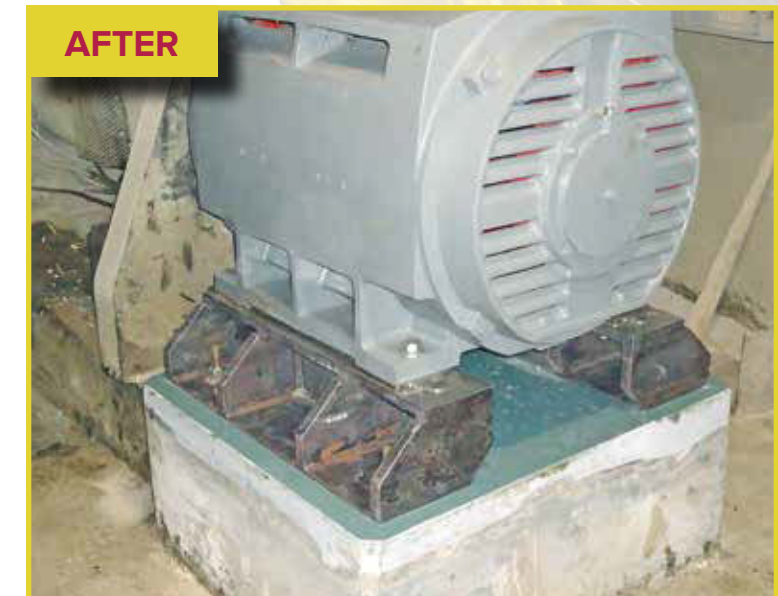
On-site turnkey retrofit of a new 500 HP pump motor, base design, fabrication, and installation.