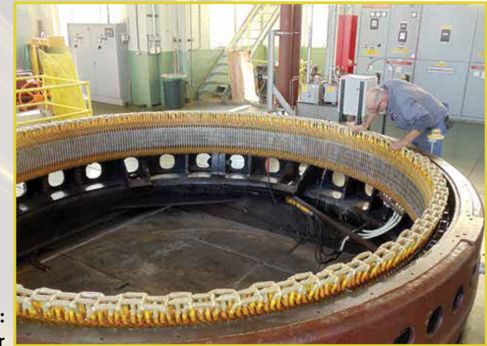
On-Site Rewind: 3,000 kW 4kV Hydro Generator